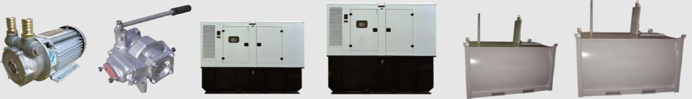
Auto filling fuel pump